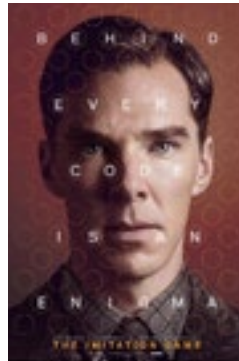
The Imitation Game