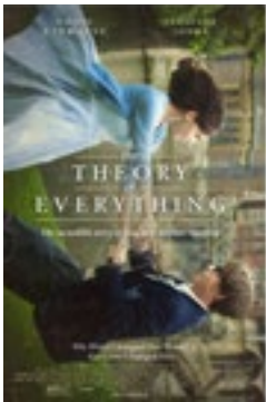
The Theory of Everything