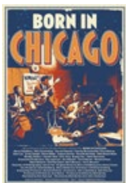
Born in Chicago (2014)