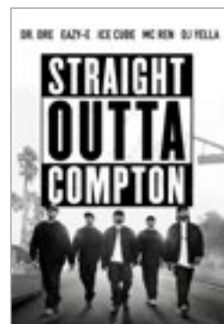
Straight Outta Compton (2015)