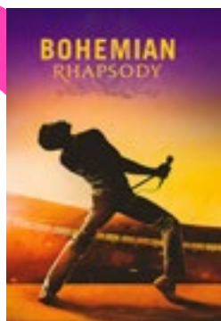
Bohemian Rhapsody (2018)