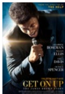
Get On Up (2014)