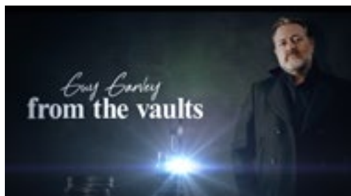
Guy Garvey- From The Vaults