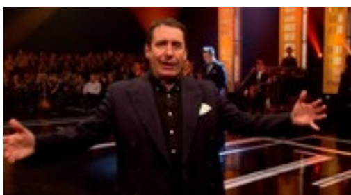
Jools Holland Later