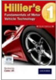
Hillier's Fundamentals of Motor Vehicle Technology book