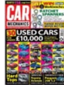
Car Mechanics magazine