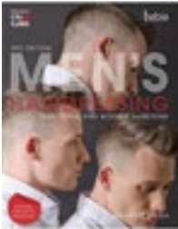
Men's Hairdressing: Traditional and Modern Barbering - £34.99