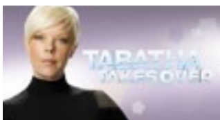
Tabatha's Salon Takeover