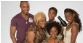
'Da Kink in my Hair'