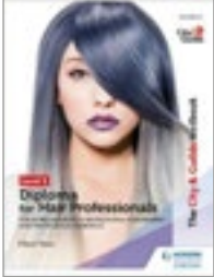
Level 2 Hairdressing and Barbering - The City and Guild Text Book