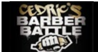
Cedric's Barber Battle