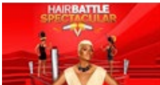
Hair Battle Spectacular