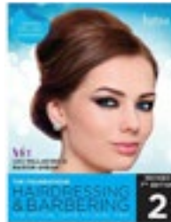
Habia Hairdressing and Barbering - £34.44