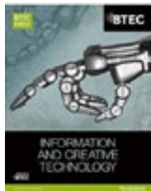
Information and Creative Technology