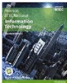
Information Technology Student Book 1