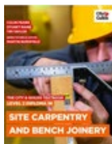
City & Guilds Site Carpentry and Bench Joinery