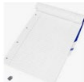
A4 pad of paper

Make sure the Applications team have got your correct email address as this will be used to send further communications and your enrolment link.