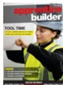
Apprentice Builder magazine