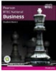
Business Student Book 1