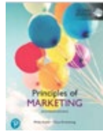
Principles of Marketing