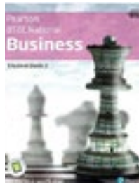
Business Student Book 2