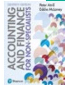
Accounting and Finance for Non- Specialists